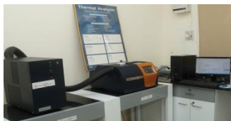
Differential Scanning Calorimeter (DSC 25) TA Instruments