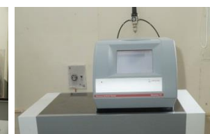
Microwave Synthesizer (Monowave 200, Anton Paar)

The CIL cater to the needs of the students, research scholar and teachers of this university as well as other educational institute and industry in order to promote research activities.