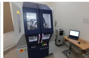
Multipurpose versatile XRD System (Smart Lab 63kW, Rigaku)