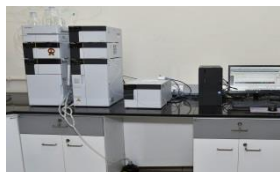
Ultra High Performance Liquid Chromatography (UHPLC)(Nexera, Shimadzu)