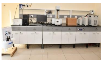
Research Grade Advance Rheometer System (MCR 302e Anton Paar)