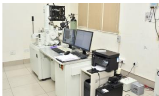
Mass High Resolution Field Emission Scanning Electron Microscope with EDS (FE-SEM)