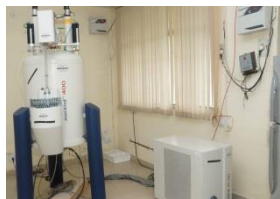
FT-NMR Spectrometer (400MHz Bruker)