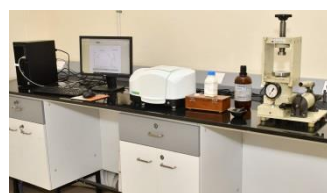
FTIR Spectrometer (Spectrum Two, Perkin Elmer)