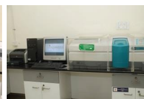
UV-VIS -NIR Spectrometer (Cary 5000, Varian)