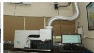
Microwave Plasma Atomic Emission Spectrometer (MP-AES Agilent 4210)